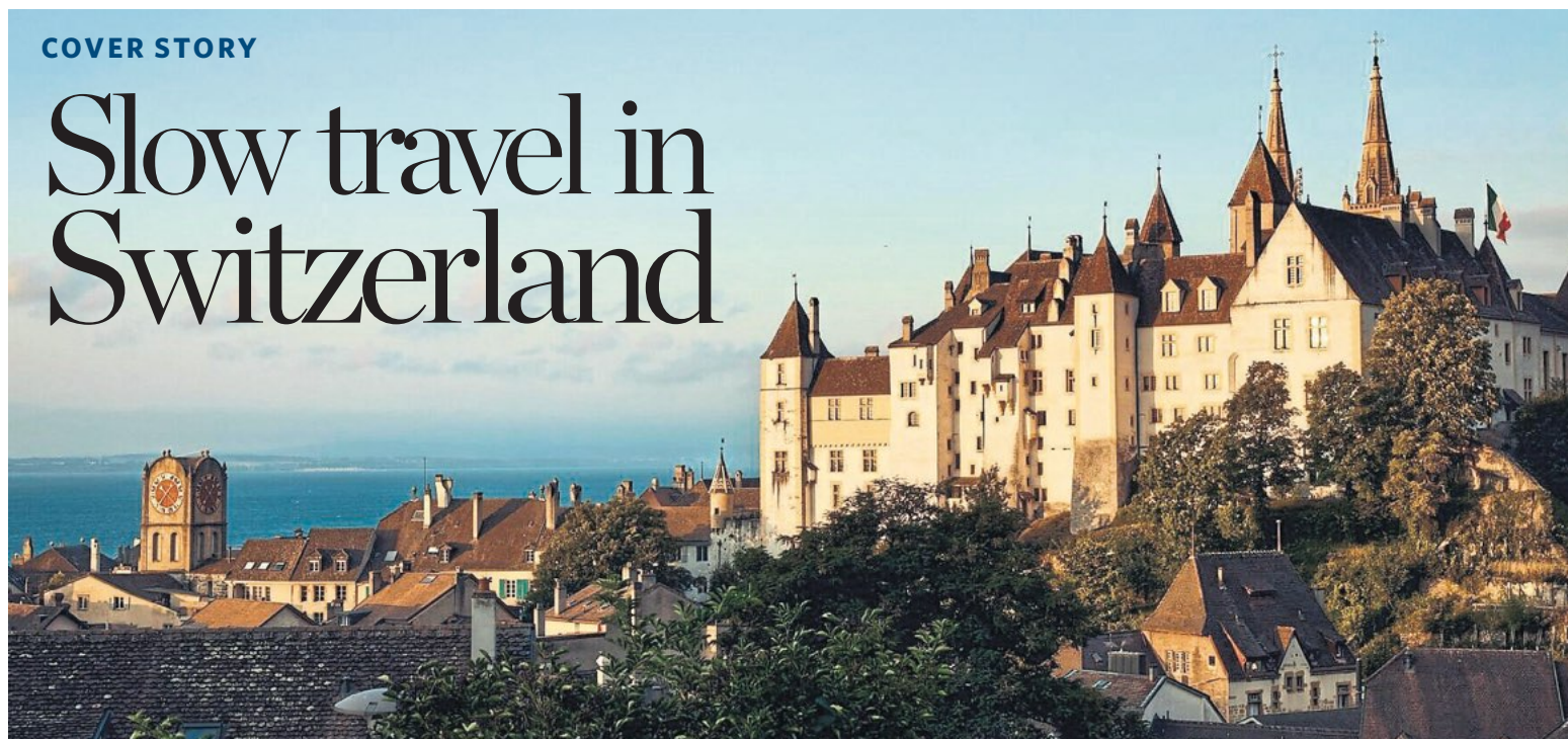
A view of Neuchâtel, a watchmaking city in Switzerland, and its 12th-century castle.