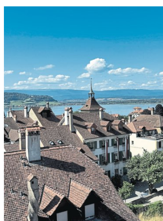
The fairy-tale roofs and whimsical chimneys in medieval Murten (also called Morat).