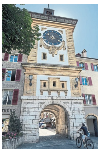
Murten's clock was built in 1712 and must be hand-wound every 24 hours.